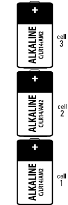
cell 3 cell 2 cell 1